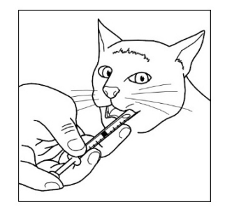
Shake well for 15 seconds before use