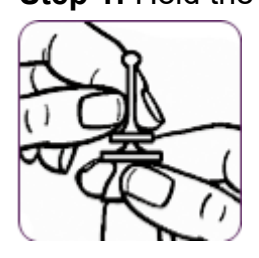
Step 1: Hold the applicator upright, placing fingers below the larger disk as shown.

Remove the spot-on applicator from the pack.