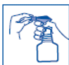
1 Adjust the nozzle

Spray the entire body of the animal, and apply from a distance of approximately 10-20 cm. Apply against the lay of the hair and make sure that the entire coat of the animal is dampened. Ruffle the coat, especially in long haired animals, so that the product penetrates down to the skin. For treatment of the head region, and when treating young or nervous pets, application may be carried out by spraying onto a gloved hand and rubbing the product into the coat. Allow to dry naturally. Do not towel dry.