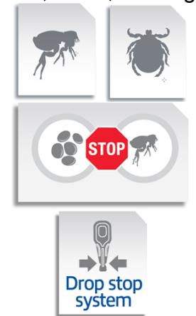
Fleas, Ticks, Flea eggs

Box containing 6 individual pipettes placed in 3 overblisters