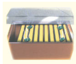
Fig. 4 Close the hive and let the product act for 7 days. Repeat the explained treatment for 4 times with the other strips and remove the possible pieces of strip at the end of the treatment.