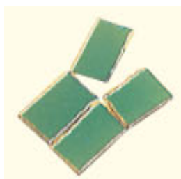
Fig. 2 Take one of the two strips and break it into 3-4 parts.