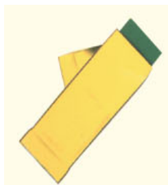
Fig. 1 Open the proper bag that contains the two strips.