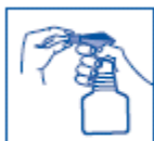
1 Adjust the nozzle

Spray the entire body of the animal, and apply from a distance of approximately 10-20 cm. Apply against the lay of the hair and make sure that the entire coat of the animal is dampened. Ruffle the coat, especially in long haired animals, so that the product penetrates down to the skin. For treatment of the head region, and when treating young or nervous pets, application may be carried out by spraying onto a gloved hand and rubbing the product into the coat. Allow to dry naturally. Do not towel dry.