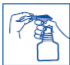
1 Adjust the nozzle

Spray the entire body of the animal, and apply from a distance of approximately 10-20 cm. Apply against the lay of the hair and make sure that the entire coat of the animal is dampened. Ruffle the coat, especially in long haired animals, so that the product penetrates down to the skin. For treatment of the head region, and when treating young or nervous pets, application may be carried out by spraying onto a gloved hand and rubbing the product into the coat. Allow to dry naturally. Do not towel dry.