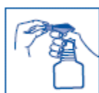
1 Adjust the nozzle