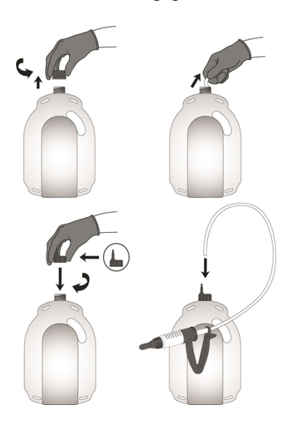
Figure 2 Attaching the recommended dosing gun to the 2.5 and 5 litre containers:

After use, coupling vented caps should be removed and replaced by PP simple cap. Vented caps should be placed for a later use in the cardboard box.