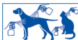
3 Large jet for back and sides, standing