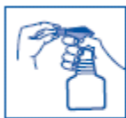
1 Adjust the nozzle

Spray the entire body of the animal, and apply from a distance of approximately 10-20 cm. Apply against the lay of the hair and make sure that the entire coat of the animal is dampened. Ruffle the coat, especially in long haired animals, so that the product penetrates down to the skin. For treatment of the head region, and when treating young or nervous pets, application may be carried out by spraying onto a gloved hand and rubbing the product into the coat. Allow to dry naturally. Do not towel dry.