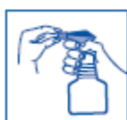
1 Adjust the nozzle

Spray the entire body of the animal, and apply from a distance of approximately 10-20 cm. Apply against the lay of the hair and make sure that the entire coat of the animal is dampened. Ruffle the coat, especially in long haired animals, so that the product penetrates down to the skin. For treatment of the head region, and when treating young or nervous pets, application may be carried out by spraying onto a gloved hand and rubbing the product into the coat. Allow to dry naturally. Do not towel dry.