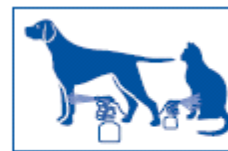
5 Narrow jet for paws and skin folds, standing