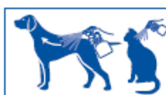
2 Spray against direction of hair growth, holding the animal