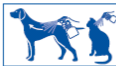
2 Spray against direction of hair growth, holding the animal