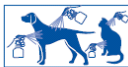
3 Large jet for back and sides, standing