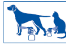
5 Narrow jet for paws and skin folds, standing